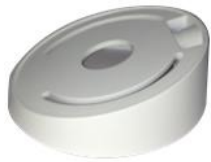
Inclined ceiling mount DS-1259ZJ