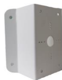
DS-1276ZJ-SUS Corner mount