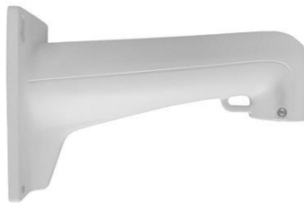
DS-1602ZJ Long-arm Wall Mount Bracket