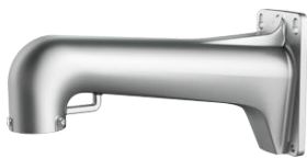
DS-1603ZJ-P Wall Mounting Bracket