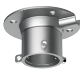
DS-1668ZJ-P Pendant Mounting Bracket