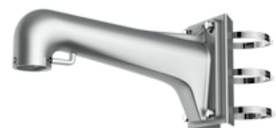
DS-1603ZJ-Pole-P Vertical Pole Mounting Bracket