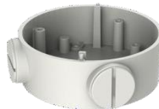
DS-1260ZJ Junction box