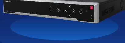
M Series NVR