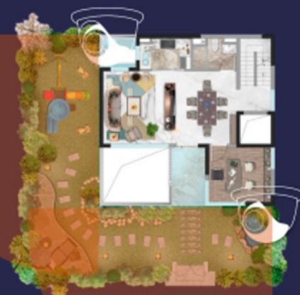
Villas or High-End Residences