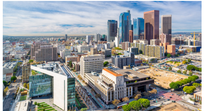
EIS with Built-In Gyroscope