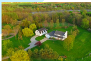
Wide Outdoor Isolated Areas