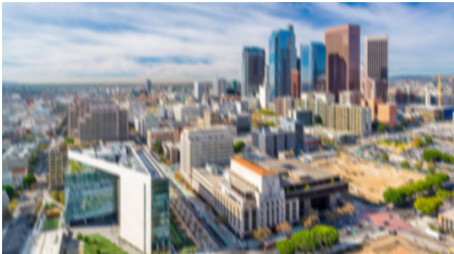
EIS (Electronic Image Stabilization) Only

Robust image stability and clarity using Gyroscope Image Stabilization to produce clear images when the environment has strong winds or other instability.