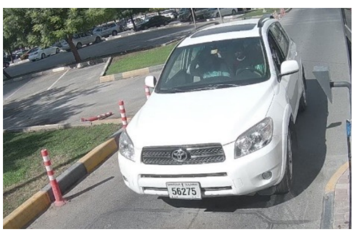
Conventional LPR Cameras