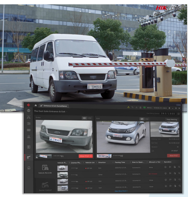
Vehicle On Road Recording

I/O, and 12VDC power output for external devices