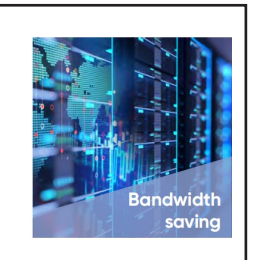
High-performance Image Sensor