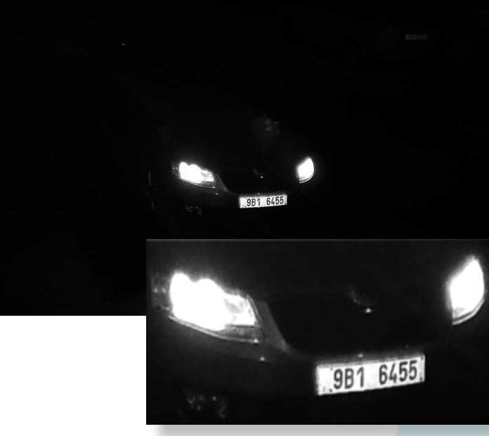
Hikvision LPR Cameras