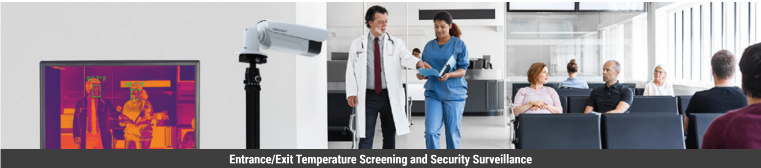
Entrance/Exit Temperature Screening and Security Surveillance