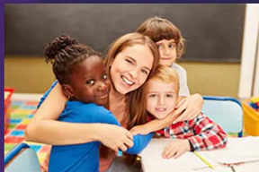
Education & Daycare