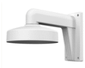
HIA-B402-130T Wall Mount