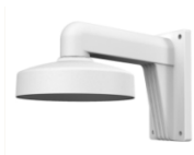
HIA-B401-110T Wall Mount