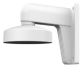
HIA-B401-110T Wall Mounting Bracket