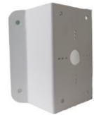
HIA-B201 Corner Mounting Bracket