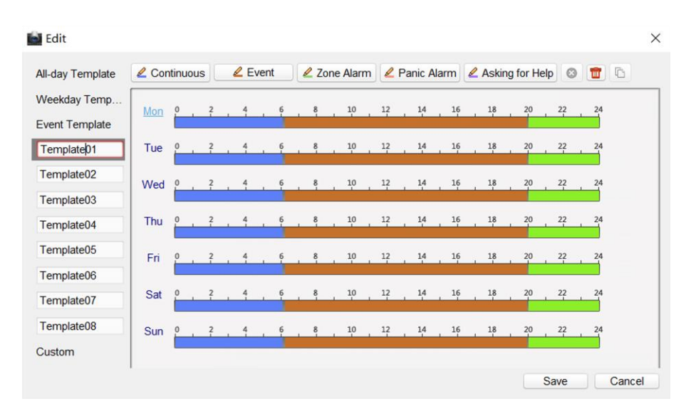
Figure 3-31 Draw a schedule time period