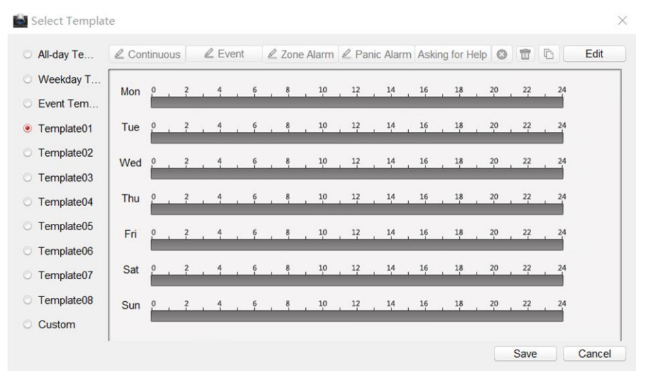
Figure 3-29 Selection the System Template

1. Select and click the text box of system editable template (Template01 to Template08).