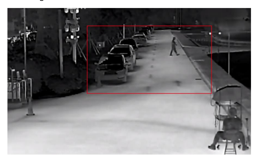
Figure 4-2 Set Rules

3. Select an Area and click Draw Area . Click and drag the mouse on the live video, then release the mouse to finish drawing one area.