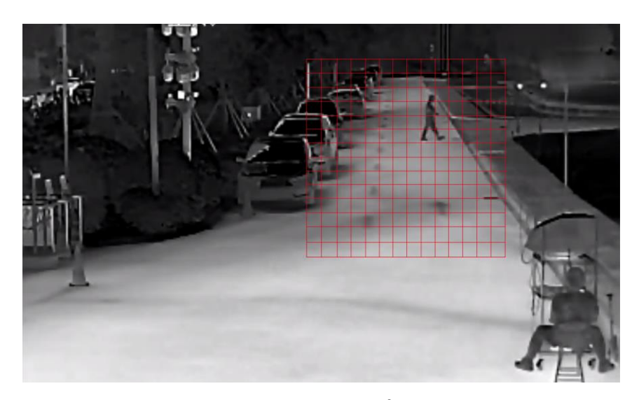
Figure 4-1 Set Rules