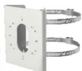
DS-1275ZJ-S-SUS Vertical Pole Mount