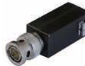
DS-1H18 Video Balun