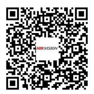
Figure B-1 QR Code of Communication Matrix

Note that the matrix contains all communication ports of Hikvision access control and video intercom devices.