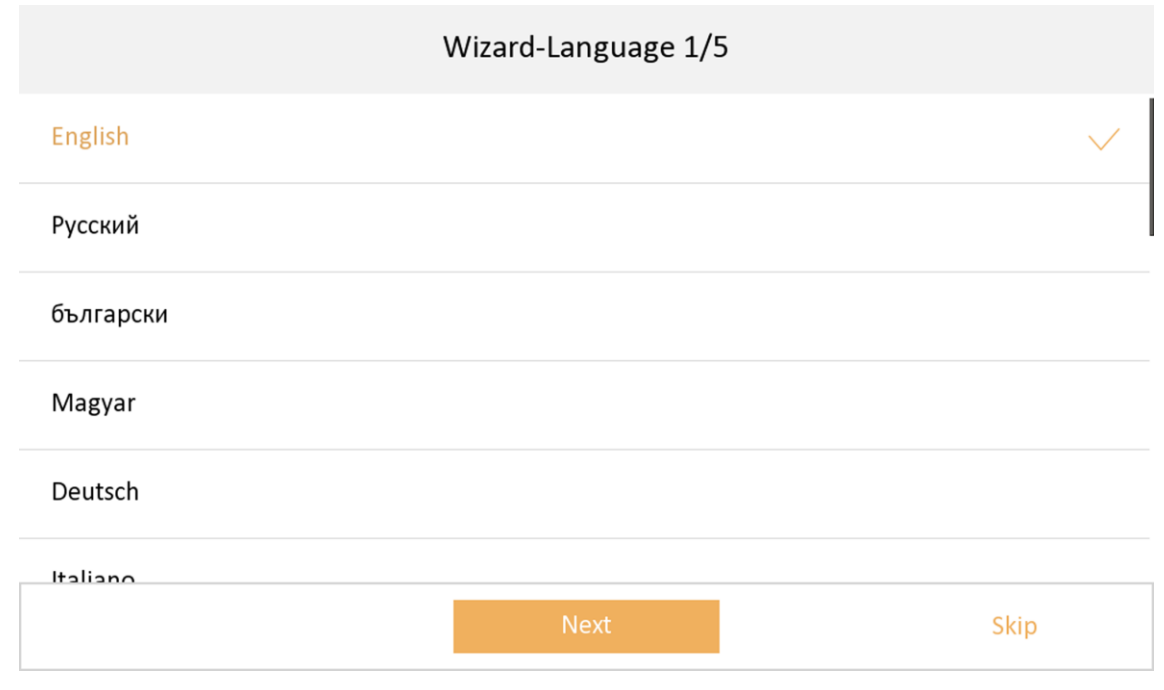
Figure 2-2 Language Settings