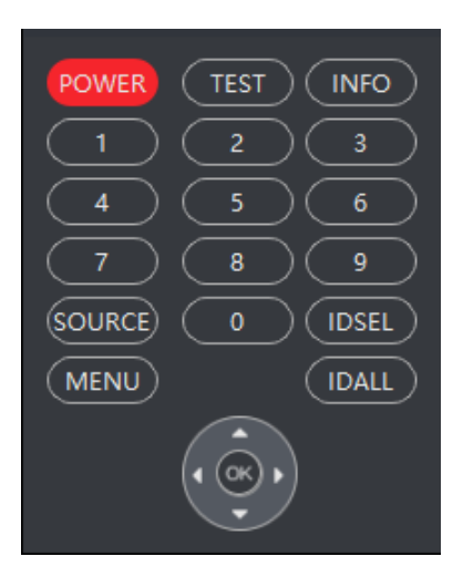
Figure 2-1 Virtual Remote Control

You can use Remote Control in the lower left corner of the client interface to control the display(s).