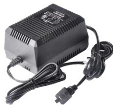
TEAC-66-243000V (EU) MKAC-66-243000U (USA) TEAC-66-243000VB (UK) Power adapter (for outdoor model)