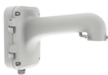
DS-1604ZJ Wall Mount