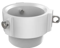
DS-1681ZJ Installation Adapter (for outdoor model)