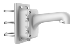
DS-1604ZJ-box-pole Vertical Pole Mount with Junction Box