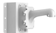
DS-1604ZJ-box-corner Corner Mount with Junction Box