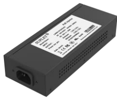
LAS60-57CN-RJ45 Hi-PoE Midspan