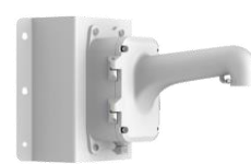
DS-1604ZJ-box-corner Corner Mount with Junction Box