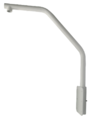
DS-1660ZJ Parapet Mount