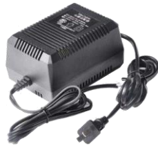
TEAC-66-243000V (EU) MKAC-66-243000U (USA) TEAC-66-243000VB (UK) Power adapter (for outdoor model)