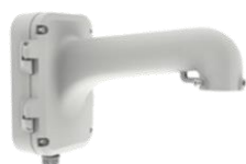
DS-1604ZJ Wall Mount