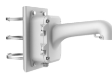
DS-1604ZJ-box-pole Vertical Pole Mount with Junction Box