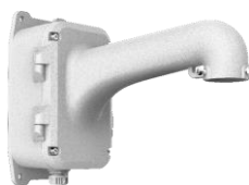
DS-1604ZJ-box Wall Mount with Junction Box