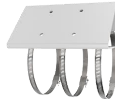
DS-1673ZJ Horizontal Pole Mount