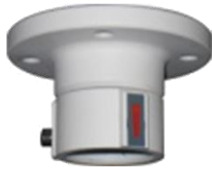
DS-1663ZJ Ceiling Mount