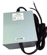
MKAC-96-248000V (UK) MKAC-96-248000V (EU) MKAC-96-248000U (US) Power Adapter