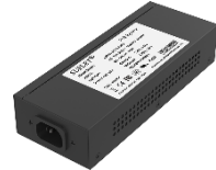
LAS60-57CN-RJ45 Hi-PoE midspan