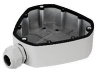
DS-1280ZJ-DM25 Junction Box