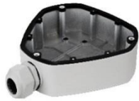
DS-1280ZJ-DM25 Junction Box