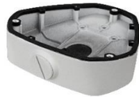
DS-1281ZJ-DM25 Inclined Ceiling Mount