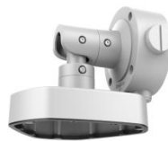
DS-1283ZJ Wall Mount (3-axis Adjustment)