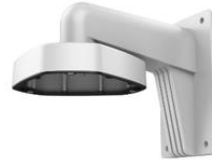
DS-1273ZJ-DM25 Wall Mount