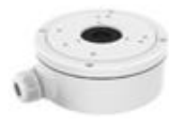
HIA-J103 Junction Box