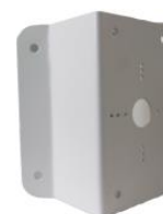
DS-1276ZJ-SUS Corner Mount