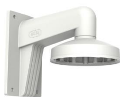
DS-1273ZJ-DM32 Wall Mount