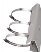
DS-1275ZJ-SUS Vertical Pole Mount