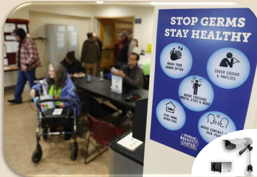
Skin-temperature based detection in high accuracy without surrounding interference