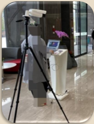
Easy installation and operation

Hikvision's temperature screening thermographic cameras are designed to detect elevated skin-surface temperatures of visitors in the elderly care home and then to take proper guidance for check and avoid contact with the elderly.