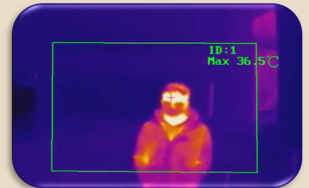
Fast temperature screening with elevated temperature alarm (pop-up image/audio warning)