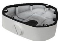
DS-1281ZJ-DM25 Inclined Ceiling Mount