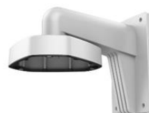
DS-1273ZJ-DM25 Wall Mount