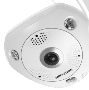
Without -V Model