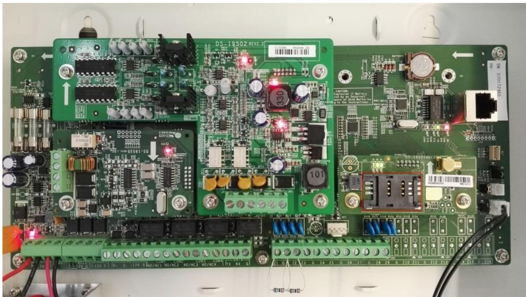
Figure 1:SIM card slot figure