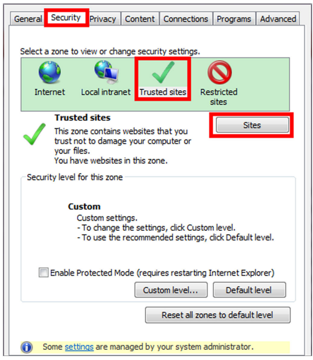
Figure 2-1 Internet Options Window

1. Open Internet Explorer's Internet Options and enter the Security tab.