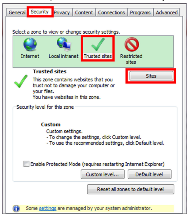
Figure 2-1 Internet Options Window

1. Open Internet Explorer's Internet Options and enter the Security tab.