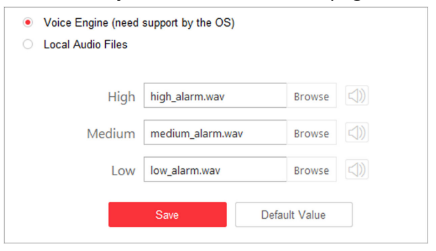
Figure 7-2 System Settings: Alarm Center

4. Enter the Control Client and enter System → Alarm Center page.