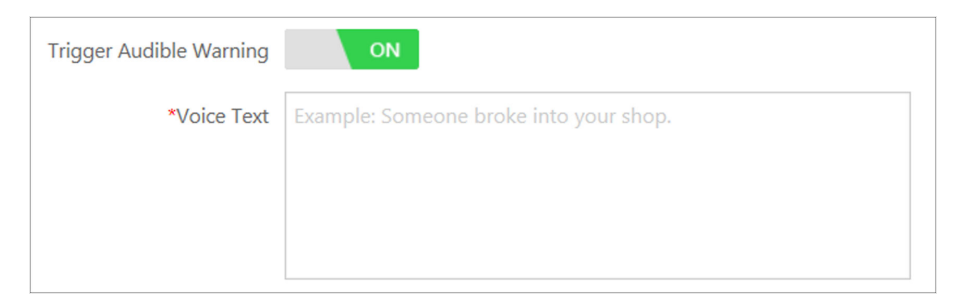
Figure 7-1 Trigger Audible Warning

4. Enter the Control Client and enter System → Alarm Center page.