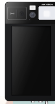
Smart onboard temperature screening terminal DS-MDH005-B

*The attendance check function will come soon.