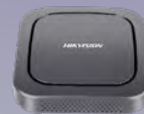
Digital signage box