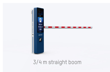
3/4 m straight boom