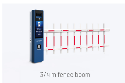
3/4 m fence boom