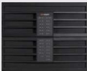
DS-C10S-S22T Video Wall Controller Chassis