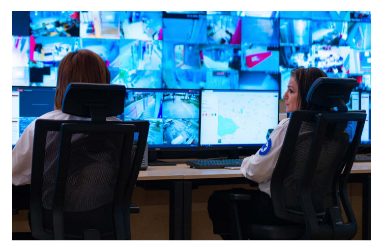
HikCentral ReGuard–Optimizes alarm processing to increase response efficiency.

Designed for Managed Video Monitoring Centres, as well as traditional Alarm Receiving Centres, HikCentral ReGuard works in collaboration with dedicated security personnel to provide expanded coverage through intelligent monitoring. The application bolsters security professionals by allowing them to provide situational focus while continually monitoring for additional incoming alarms to ensure continuous coverage.