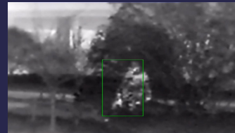
Hikvision Heatpro Series Thermal Camera