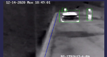
Hikvision Heatpro Series Thermal Camera