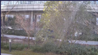
Conventional Optical Camera