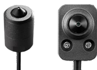
DS-2CD6412FWD-10 (Cylindrical sensor unit) DS-2CD6412FWD-20 (L-shaped sensor unit)