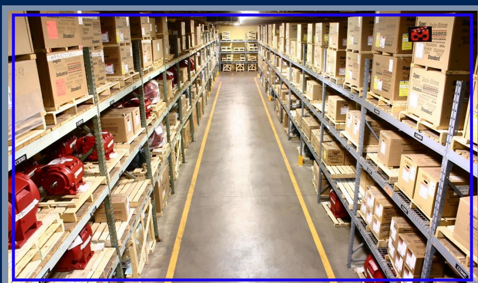
Full screen detection by default