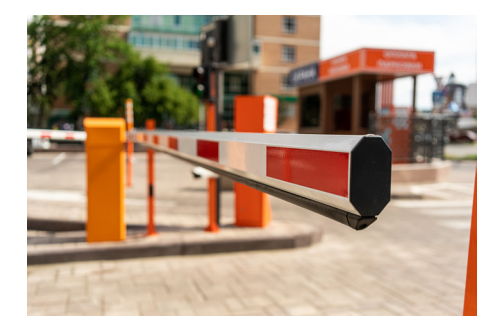
Entry and Exit Control