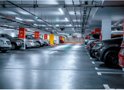
Car Park Management