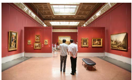
Retail Centres Petrol Stations Museums