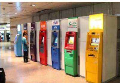
Independent ATMs ▶ ATM Monitoring ▶ Video Surveillance