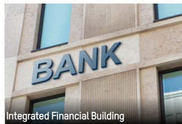
Integrated Financial Building