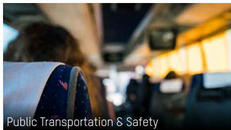
Public Transportation & Safety