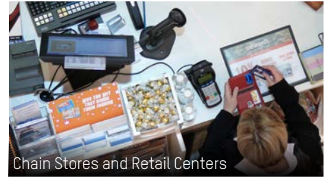
Chain Stores and Retail Centers