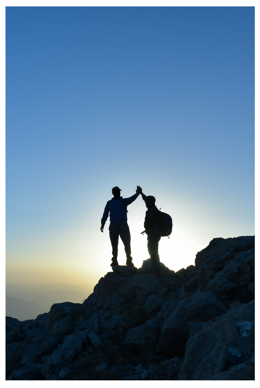
For a world of applications, today and tomorrow.