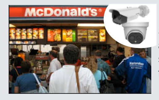
Skin-temperature based detection in high accuracy without surrounding interference; simultaneous temperature screening for up to 30 persons

The Solution is designed for the restaurant to take fast temperature screening and flow control applications and provide a safer and healthful environment for customers.