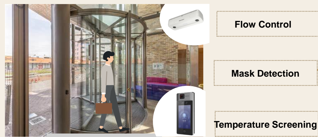
Entrance & Exit

The Solution is designed for the city hall to take fast temperature screening, flow control and mask detection in the entrance & exit and office hall to provide a safer and healthful environment.