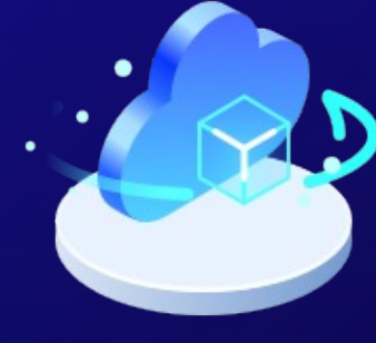
Easy to Deploy